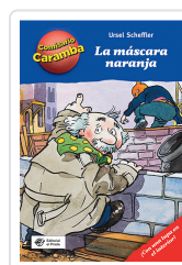
MASCARA NARANJA, LA (COMISARIO CARAMBA 2) SCHEFFLER, URSEL