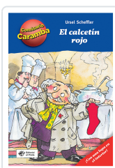
EL CALCETIN ROJO, EL (COMISARIO CARAMBA 1) SCHEFFLER, URSEL